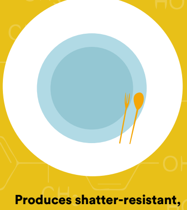
lightweight plates, cutlery and drinkware

Makes sunglass lenses shatter-resistant and lightweight