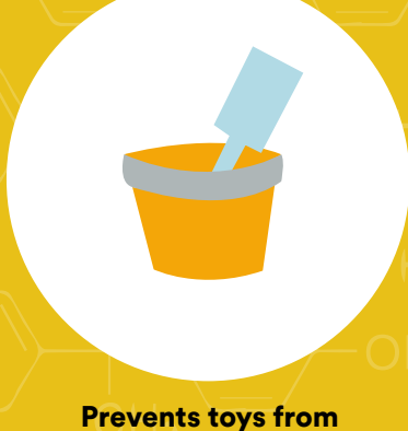
cracking or breaking